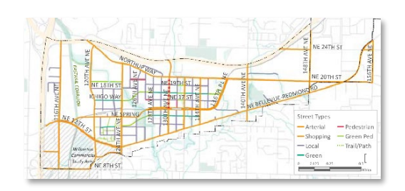
2021 Red Street Scape Plan